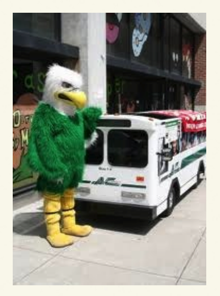
Laney College Mascot

The availability of this newly launched program at Laney College can be of great help to construction, electrical, and renewable industry. Finding qualified employees has always been a challenge and with this certified and approved program employers can hire their employees with confidence.