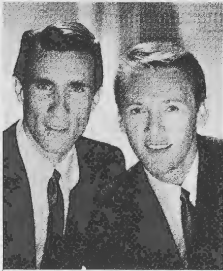
Righteous Brothers November 1965