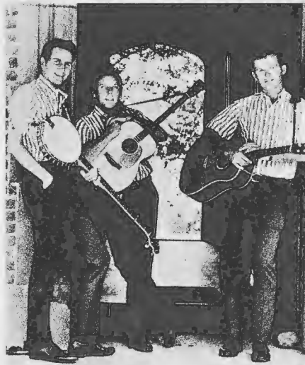
Kingston Trio March 1966