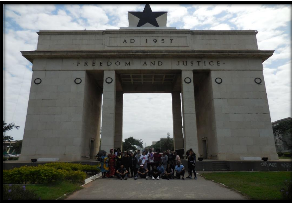
DANCE STUDY ABROAD STUDENTS IN GHANA, WEST AFRICA - SUMMER 2016