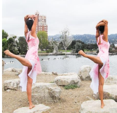
Dance Degree Curriculum Requirements Note: A minimum of 19 semester units are required for the degree. Laney College Dance Major Worksheet

Provide information to the community about dance classes, performances, workshops and choreographic opportunities both on and off campus.