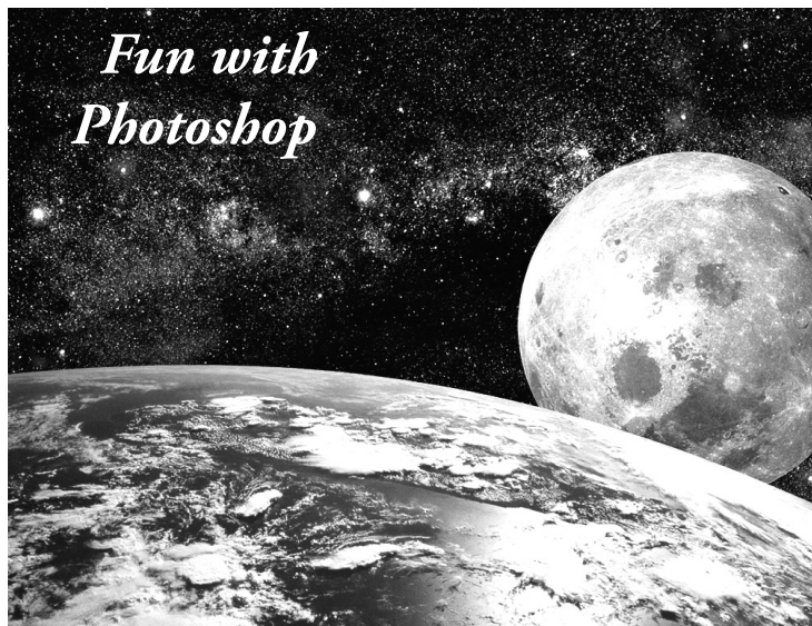
Three images were combined using the layer mask feature.

Extra Credit projects, when available, will add an additional 3% of total points for each extra credit project to your final grade total.