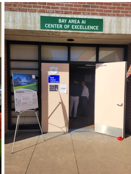
AI Center of Excellence

Laney College celebrated the grand opening of the Bay Area Artificial Intelligence Center of Excellence during an open house event on November 21 st in Building F, Room 254. Students, faculty, industry partners, and community leaders gathered to explore the new space and learn about Laney's state-approved AI programs, including certificates in Applied Generative AI, Deep Learning, and Natural Language Processing.