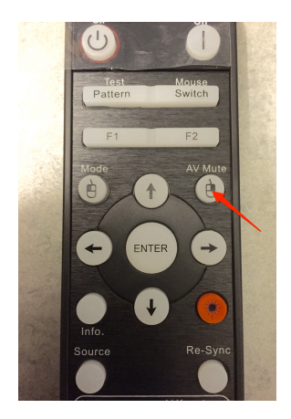
To put the projector in standby mode use the Optoma projector remote and select "AV Mute"