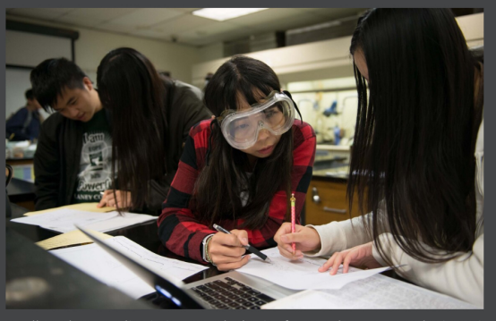
Laney College does not discriminate on the basis of race, color, sex, sexual orientation gender identity, pregnancy, marital status, religion, disability, age, national or ethnic origin, veteran status, or genetic information. This nondiscrimination policy covers admission, access, and treatment in College programs and activities.

Tower Building, 3rd Floor Phone: (510) 464-3326 Website: https://Laney.edu/counseling/