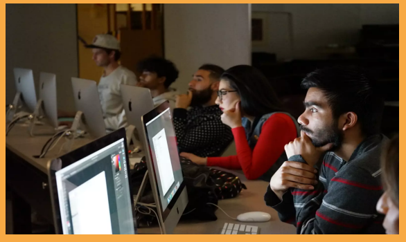
Laney College does not discriminate on the basis of race, color, sex, sexual orientation gender identity, pregnancy, marital status, religion, disability, age, national or ethnic origin, veteran status, or genetic information. This nondiscrimination policy covers and treatment in College programs and activities.

Tower Building, 3rd Floor Phone: (510) 464-3326 Website: https://laney.edu/counseling/